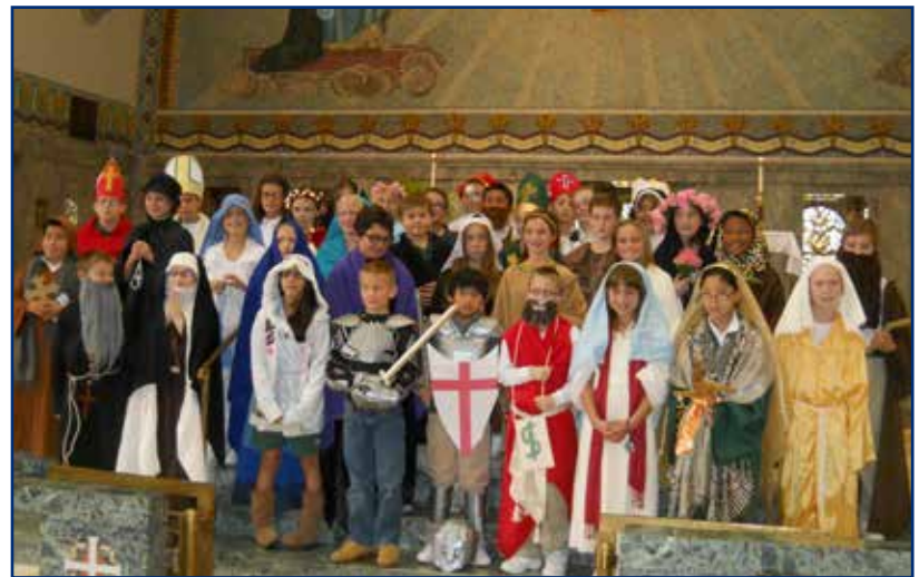
5th-grade made the Saints come alive for the annual MSS All Saints Day Mass held at the Basilica of the National Shrine of St. Elizabeth Ann Seton on November 3.

From building rockets to learning about Photovoltaic Cells (solar power), students in 4th, 7th, and 8th grade put their scientific know-how to the test during one of the Science, Technology, Engineering, and Math (STEM) clubs offered at MSS. Guest speakers from our community, including the Frederick County Sheriff's Office and Mount St. Mary's University often come in to speak with club members, inspiring them to broaden their minds through in-depth scientific investigation.